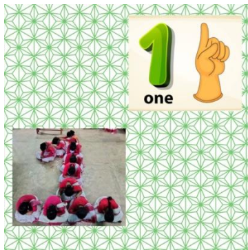
Link with concrete object