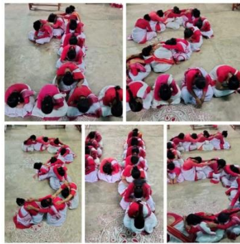
Performing number Rhyme