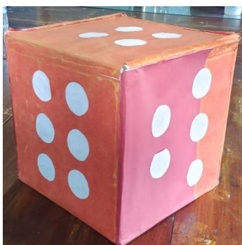
Concept of numbers with the help of Dice